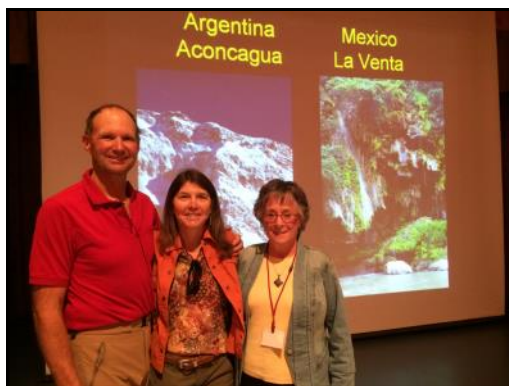
Adventure Travel, Argentina 11-08-15