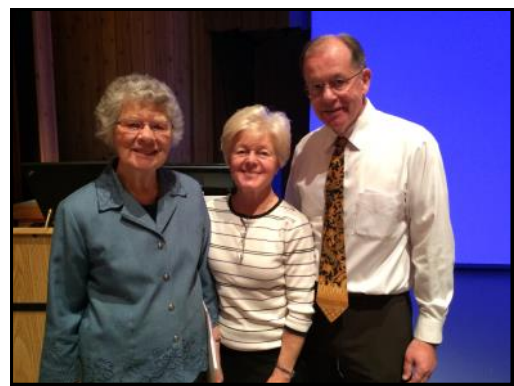
Scenes of early Idaho Falls 2-24-16