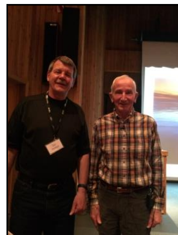
Climate Change Dynamics 2-10-16