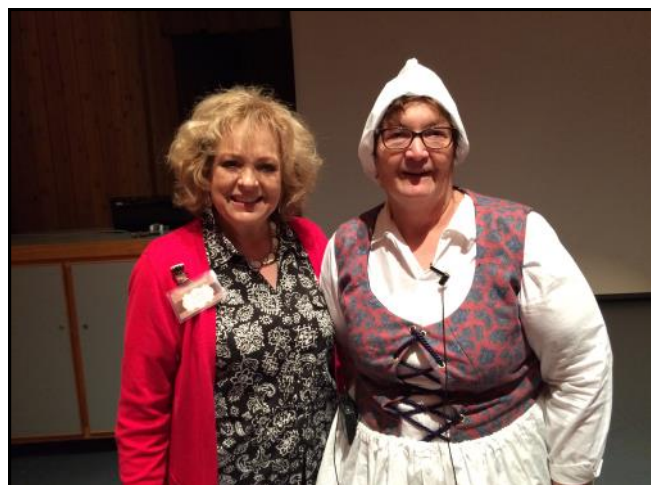
Mayflower Traveler 11-20-15