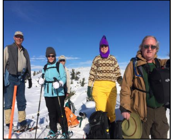
Snowshoeing Craters of the Moon 1-15-16