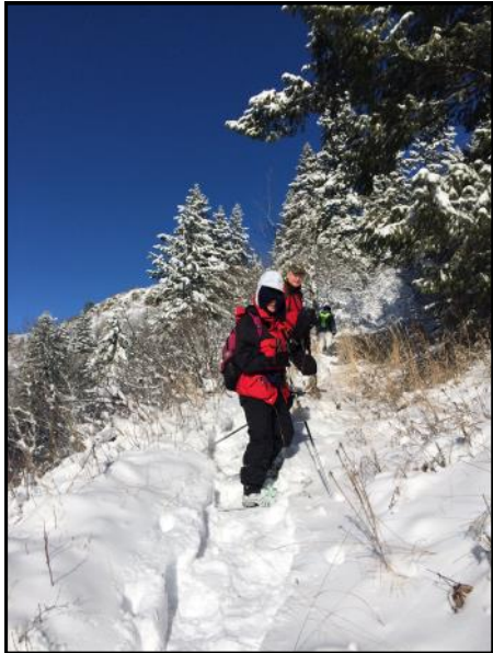
Snowshoeing Kelly Canyon 12-15-2015