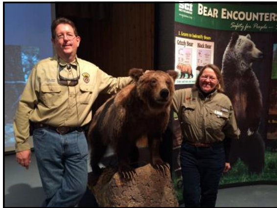
Bear Aware Identification & Safety 3-16-2016